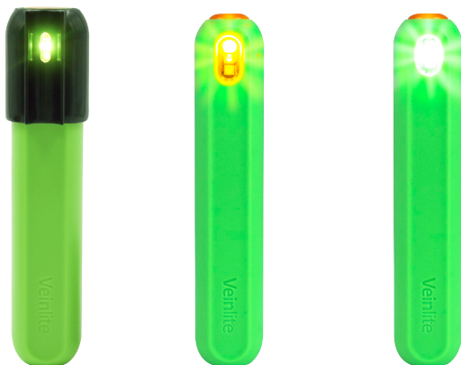
Orange Light for viewing arteries; shown with rat tail adapter