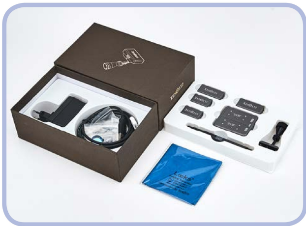
L 2 SW Full Set Box